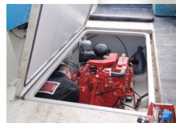
KPM Engineers fit KPM Pumps and strainers